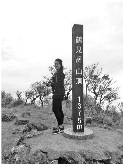
My friend at the top of Mt. Tsurum

We hurriedly ate our lunch in the cable car station before beginning the long descent down the mountain. There is a cable car service that runs up and down Mt. Tsurumi, but we decided to go by foot. The way down was difficult, especially for someone as clumsy as me (I often had to half-slide on my back down some of the rockier scrambles). When we eventually reached the bottom of the mountain, we were exhausted but triumphant, and went to eat a large meal of Indian food to celebrate. I would also recommend any potential hiker to go to one of Beppu's wonderful onsen to rest their weary legs.