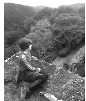
Fukoji Temple Buddha (top), Autumn leaves at Oka Castle Ruins (bottom)