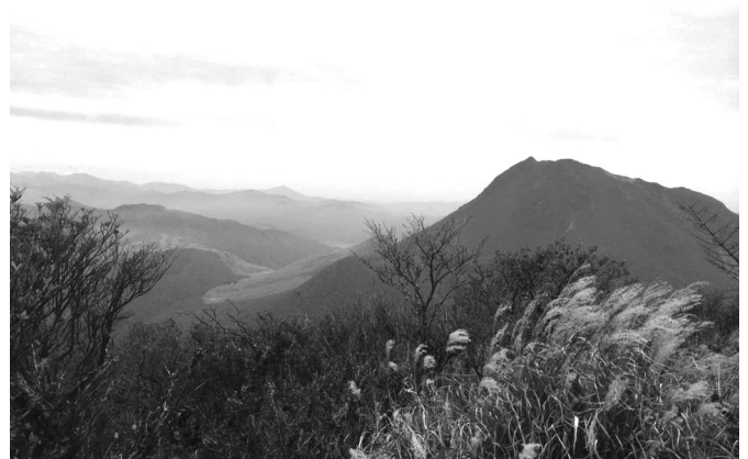
The misty view from the top of the mountain

However, when we occasionally stopped to catch our breath and have some water, we caught glimpses of the beautiful views between the trees, giving us new energy and motivation. We carried on clambering over rocks and branches, until eventually the trees began to disperse and suddenly we were on an open, mist-shrouded path leading to the top of the mountain. We were ecstatic to reach the top (see the photo below for evidence of our smiling faces) and the views from the top of the mountain were, though misty, beautiful.