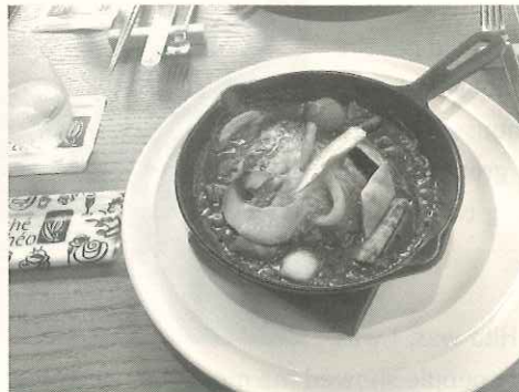
It wouldn't be a trip to Yufuin without getting to eat something delicious. In this case, hamburger with vegetables and a lovely roll cake.

Following the symposium, my friend drove me to a beautiful café located slightly apart from the hustle and bustle of Yufuin's main shopping street, and we chatted about the film over delicious cake and tea. It was the perfect end to a lovely morning. If any readers have not been to the Yufuin Cinema Festival before, I thoroughly recommend checking out next year's film festival. --- Miriam