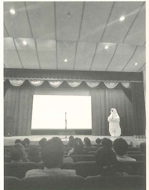
It's not every day that I see a polar bear introducing a film...

Luckily, soon everything became clear (a similar polar bear featured prominently during the film), but it was certainly a memorable introduction to my first film festival in Japan, and set the tone for what turned out to be a quirky and memorable film. After the credits rolled, we were able to attend a symposium with the film's creators, during which they took questions from members of the public. It was fantastic to be able to hear the thoughts and opinions of my fellow cinema-goers and the people who had created the film.