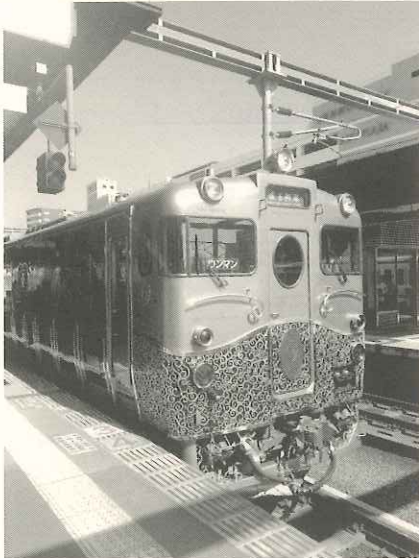
The JR Kyushu Sweet Train waiting at Oita Station (sadly I did not get to ride on it!) A sunny day in Usuki.