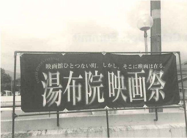
The sign points out that Yufuin is a "town without a single cinema"

I'm a huge fan of film and I love going to the cinema. Being British and living in Japan, I have the opportunity to see many Japanese films that may not get a theatrical release back home in the UK. Not only is this great for my Japanese study, but it also means I get the chance to see films I otherwise may not have gotten to see. So when my friend told me that every year Yufuin in Oita Prefecture holds a film festival and asked me if I would like to go, I jumped at the chance.