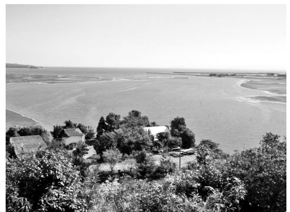
A view from the top of Kitsuki Castle.