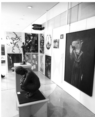
Photograph of the mini art exhibition, recently held near the Oita International Plaza offices.

Message from the editor: Happy New Year to all readers of the TOMBO! Thank you for having stuck with us while we have been going through the process of changing editors. I would also like to thank you for your patience and support as I learn the ropes. I have some plans for the TOMBO in the New Year, such as a possible TOMBO mascot and the addition of a regular TOMBO cartoon/comic strip, but as always, any suggestions and comments from readers are always welcome.