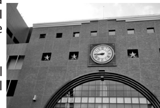
The new Oita Station.

公益財団法人 大分県芸術文化スポーツ振興財団 大分市高砂町2-33 OASISひろば21 (B1F) ☎ 097-533-4021 FAX: 097-533-4052 国際交流プラザ Oita International Plaza Oita Prefecture Arts, Culture & Sports Promotion Foundation OASIS Hiroba 21 (B1F) 2-33 Takasago-Machi, Oita-Shi 870-0029