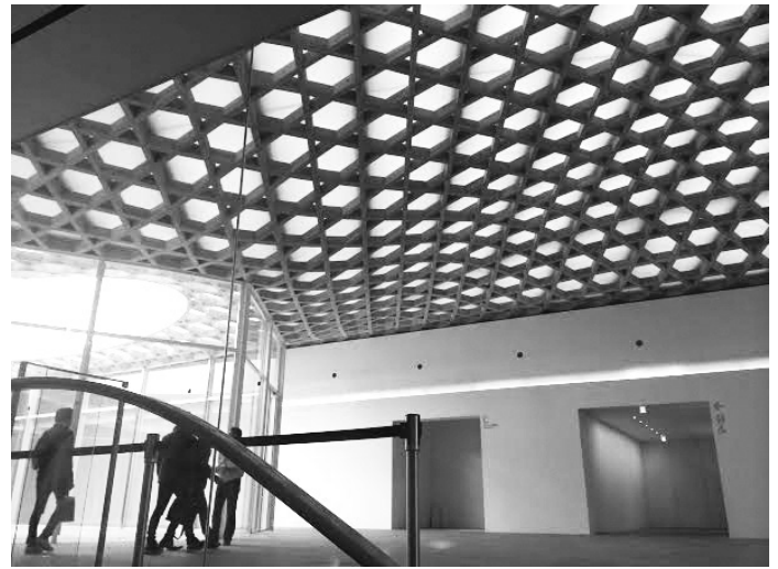
The pedestrian bridge leading to the museum (left). A bamboo ceiling on the second floor (right).

The OPAM building was designed by the world-famous Pritzker Prize-winning architect Shigeru Ban, with the bamboo architectural motif inspired by traditional Oita crafts. I'd seen the building countless times on my way to and from Oasis Tower and I was eager to explore the inside. I wasn't disappointed.