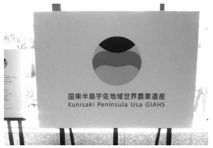
Kunisaki Peninsula Usa area GIAHS logo

Japan is currently facing a future with an increasingly aging population and decreasing birth rate, not to mention the issues of globalisation and environmental degradation. As in many other prefectures, younger generations are moving to bigger cities, and there is a tendency toward a lack of interest in the farming, forestry and fishery industries. Now that Oita Prefecture has received GIAHS designation, it is hoped that with increased awareness of these issues, and attractive incentives from prefectural and local governments, younger generations will return to agriculture and farming. The Kunisaki Peninsula Usa area GIAHS Promotion Association which is comprised of prefectural and local government and local communities, is working