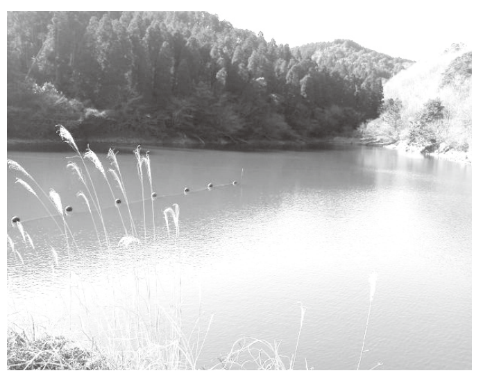
Tameike irrigation pond in the Tsunai region

This system has been fine-tuned by generations of local residents, in an area with a history of low rainfall and short, steep rivers that run quickly from Mt. Futago at the centre of the peninsula out to the sea. Faced with the challenge of securing water resources for crop cultivation, from the 11<sup>th</sup> century onward the area's inhabitants opened land for crop cultivated and began devising an interlinked "Tameike" irrigation pond system in which multiple ponds were strategically built starting at the furthest upstream point of Mt. Futago. Today there are a total of 1,200 interlinked irrigation ponds connected by open channels to allow for maximum catchment area. Management of the ponds is carried out entirely by the local farmers with a designated "Ikemori" manager in charge of ensuring that the water is distributed equally and fairly to all farmers.