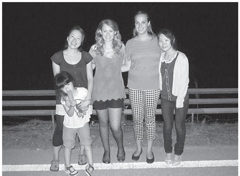
Firefly viewing with friends in Bungotakada