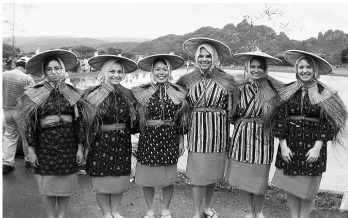
Traditional rice planting experience in Bungotakada