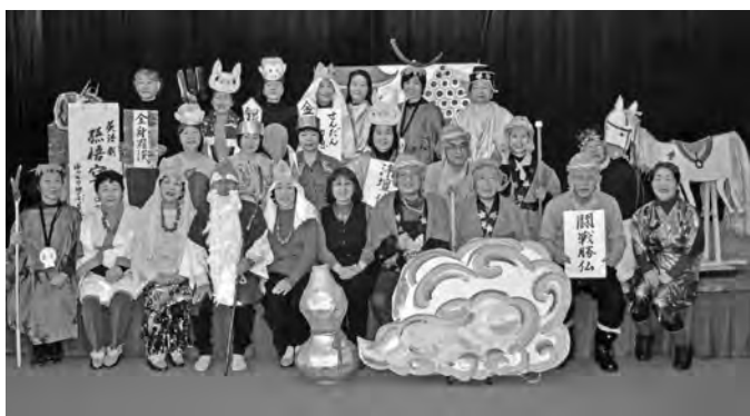
23 rd Happyoukai, “Songokuu”, 2011

“Katakana English” first flooded into Japanese newspapers and magazines approximately 25 years ago. “Katakana English” is where English words are written in Katakana the way they sound. As a result, most elderly people who read these newspapers and magazines didn’t understand what was being said even though it was written in Japanese.