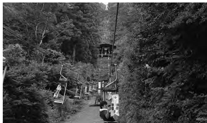
The ride up to Rakanji temple

central altar to be blessed and nailed onto the wooden planks that are in front of the statues at a later date.