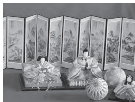
Hina matsuri dolls 2012