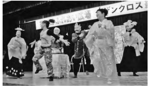
20 th Happyoukai, "Urashima Taro" 2008