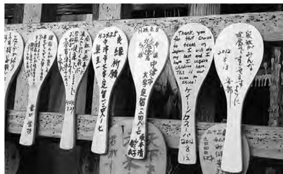
A few weeks later I return to find my rice paddle

We bought our rice paddles and sat down to write, but thinking of a wish on the spot was challenging. The outer portion of this cave is also filled with stone statues that watch quietly as I struggle to think of something to write. When our rice paddles are finished they are placed in a basket in front of the